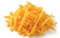
6 oz. Cheddar cheese: Zinc