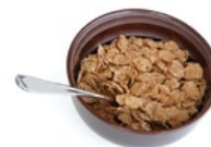
2 cups bran flakes: Magnesium