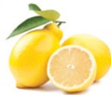
23 lemons: Folate