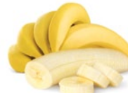
9 bananas: Phosphorous