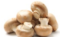
2 cups mushrooms: Copper