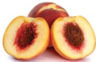
25 peaches: Vitamin A