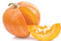
13 cups of pumpkin: Calcium