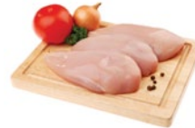
26 oz. chicken breast: Vitamin B12